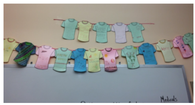
Figure 5. "Sense of Hope" T-shirts.

Because the management at BCAC support and were able to operationalize the Organizational Resiliency Model, staff took on the tasks of planning agency-wide activities that reinforced the resiliency elements. As the program evolved, BCAC was no longer doing vicarious trauma training, but rather, they were implementing a resiliency program. This shift in thinking promoted creativity, and additional activities were developed to reinforce the five elements. Today, the elements of resiliency are incorporated in monthly all-staff meetings and in new programs for BCAC staff.