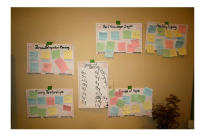
Figure 2. A board in the kitchen explains each element and suggests appropriate activities.

mornings, allowing time for staff to attend meetings or trainings or to catch up on their work before the weekend. Cook-offs focus on different food groups and allow staff to taste and savor a variety of healthy foods. Zumba®-type classes help staff blow off steam through strenuous (but fun) exercise.