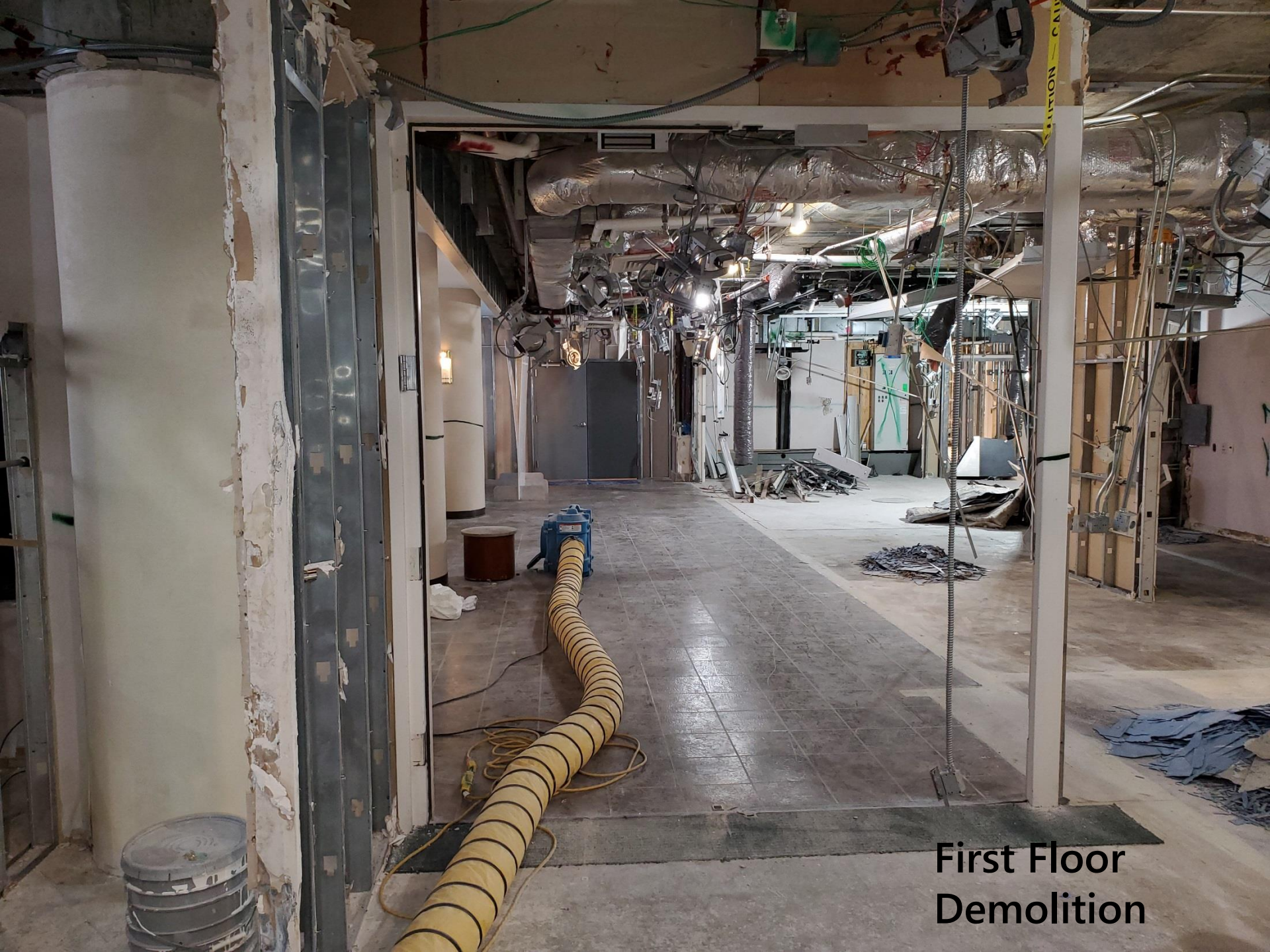
First Floor Demolition