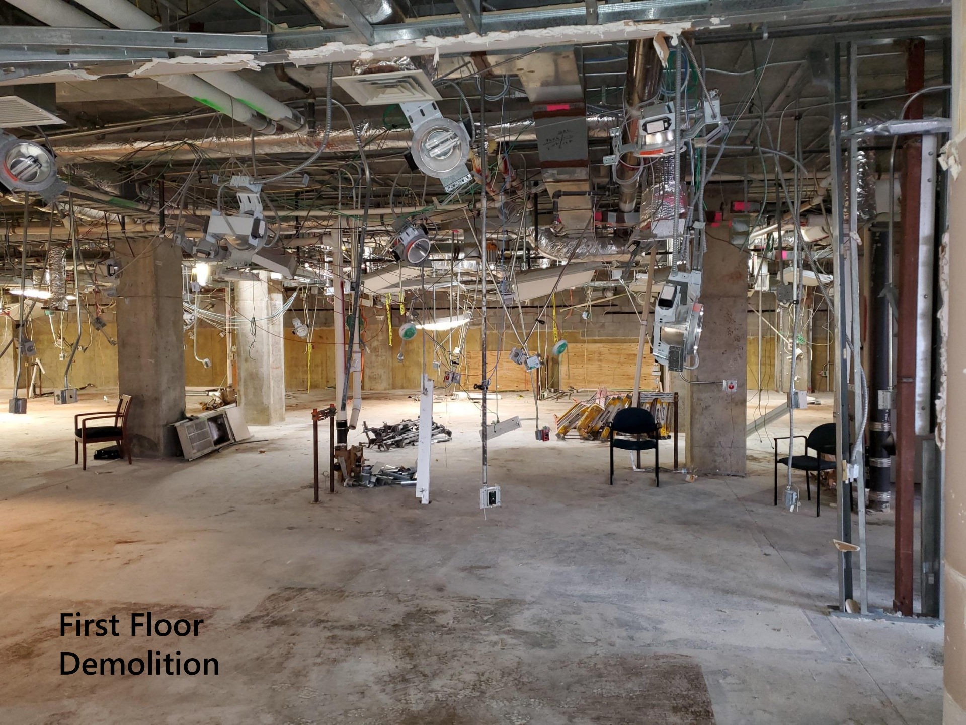
First Floor Demolition