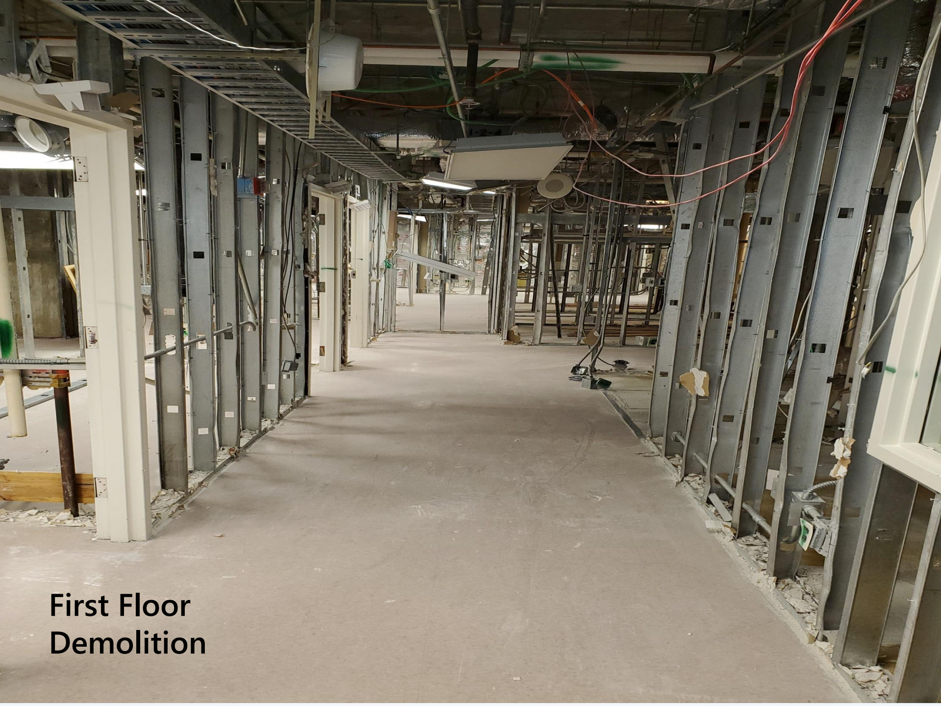
First Floor Demolition