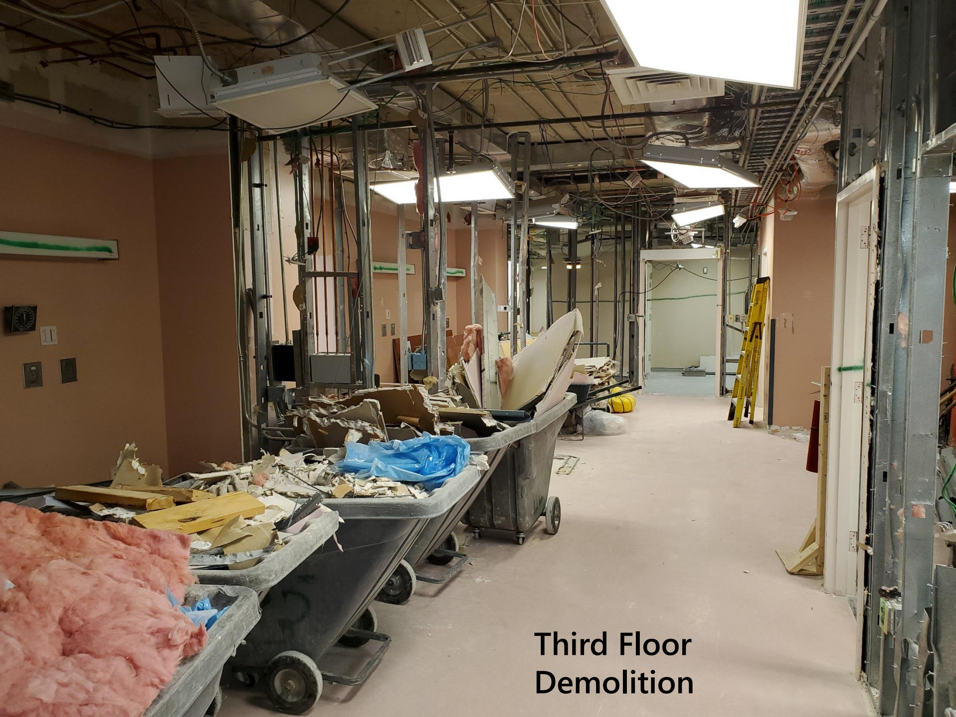
Third Floor Demolition