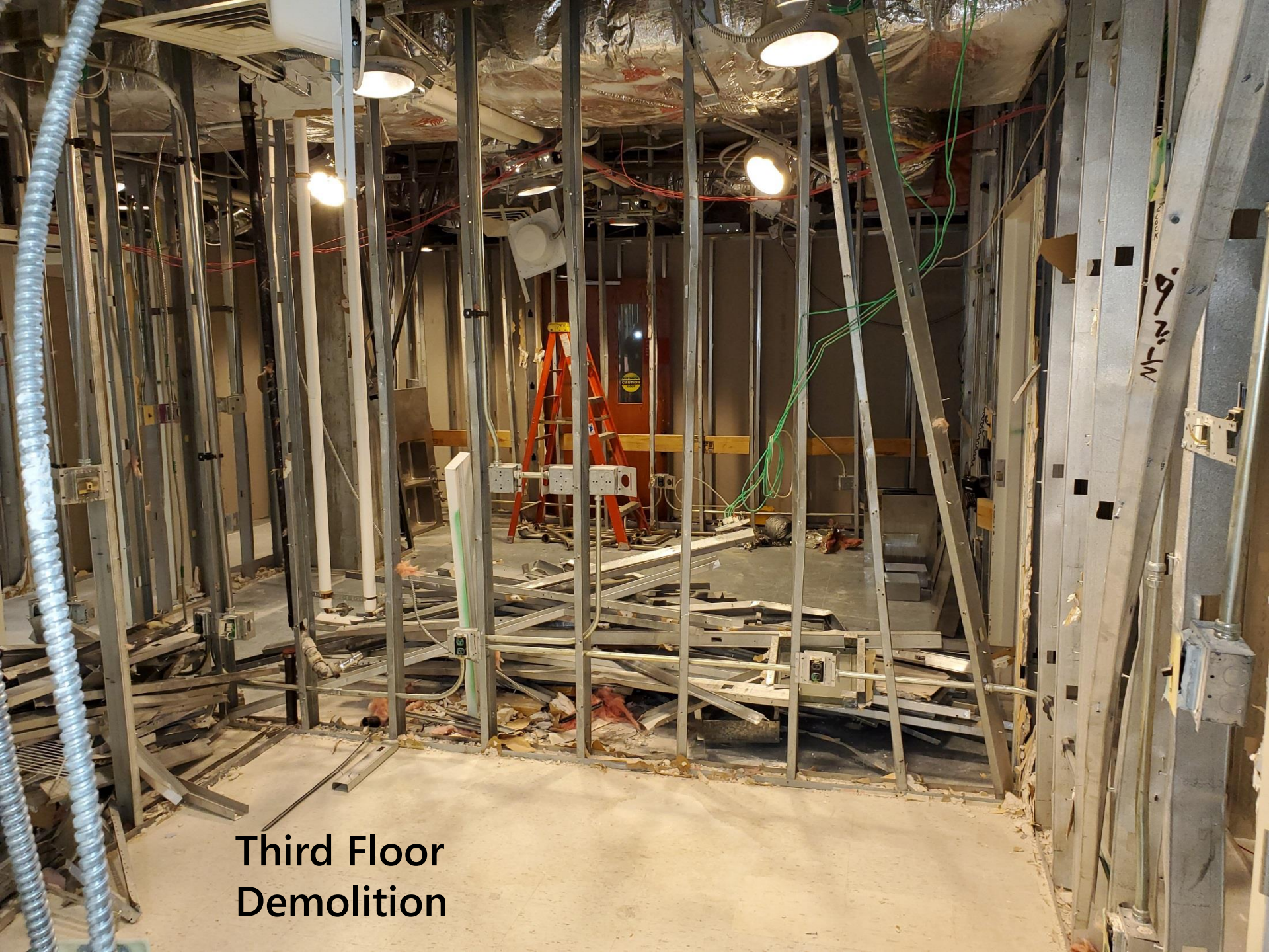
Third Floor Demolition