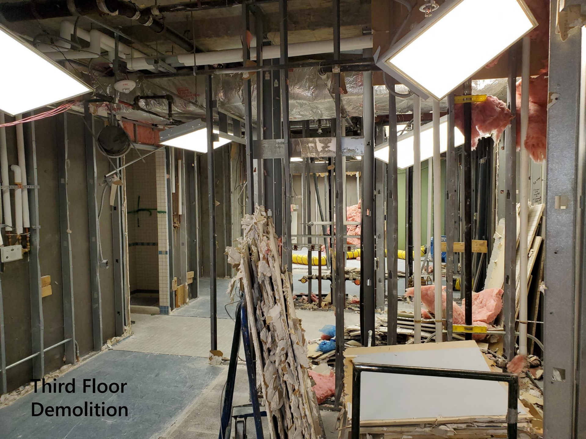
Third Floor Demolition