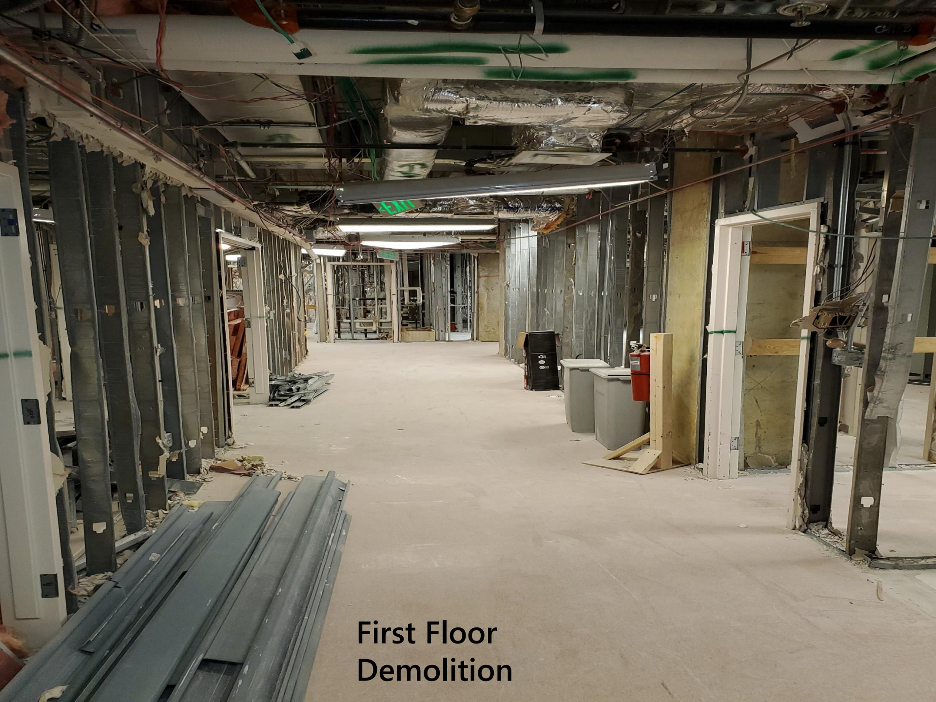
First Floor Demolition