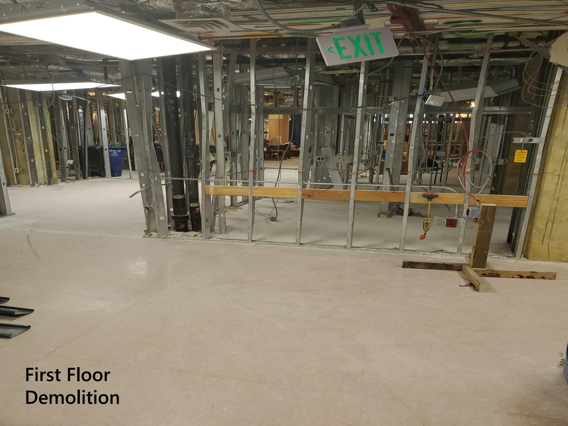
First Floor Demolition