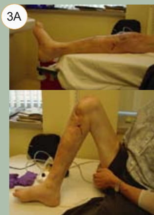
3A Two-week postoperative visit.