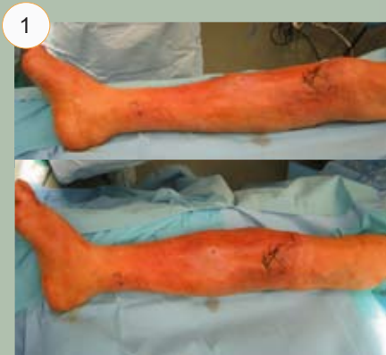
1 Preoperative photo: 58-year-old male with diabetes and a segmental tibial shaft fracture treated with IM rod. Photo obtained 3 weeks after initial surgery. Patient has cellulitis and deep infection.