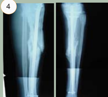
4 Three-month postoperative radiographs.