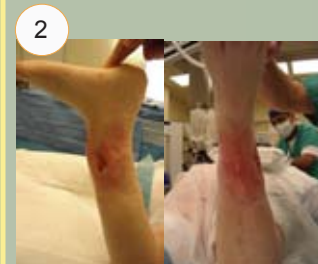
2 Preoperative clinical photo shows poor anterolateral soft tissue envelope.