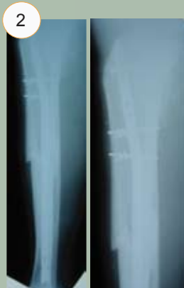
2 Preoperative radiographs.