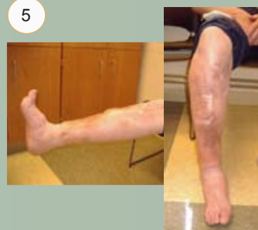
5 Two-year follow-up. Complete healing was achieved with no sign of infection.