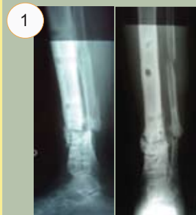
1 Preoperative radiographs: 60-year-old female with infected distal tibial nonunion, diabetes, and one-vessel leg. Previous Ilizarov treatment failed.